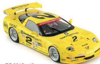
RS 0215 - #2 24h Daytona 2001 - GT2 Class Winner R.Fellow - C.Kneifel - J.Bell