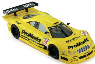
RS 0198 CLK GTR ProMarkt livery #14 GT1 Class