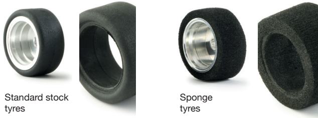
Standard stock tyres