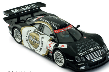
RS 0199 #3 CLK GTR Warsteiner Edition #6 GT1 Class