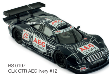
RS 0197 CLK GTR AEG livery #12 GT1 Class