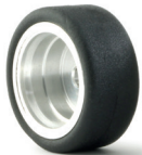
Standard stock tyres