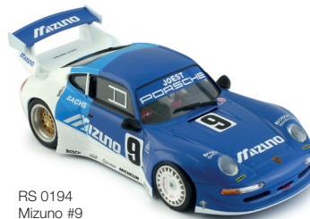
RS 0194 Mizuno #9