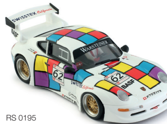
RS 0195 Stadler Motorsport #62 FIA GT Championship 1998