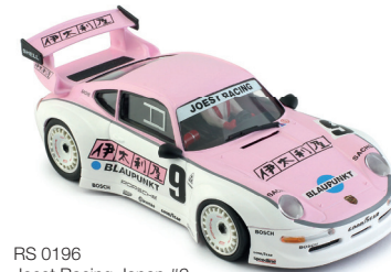
RS 0196 Joest Racing Japan #9