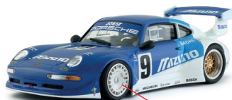
RS107R Insert (x4)